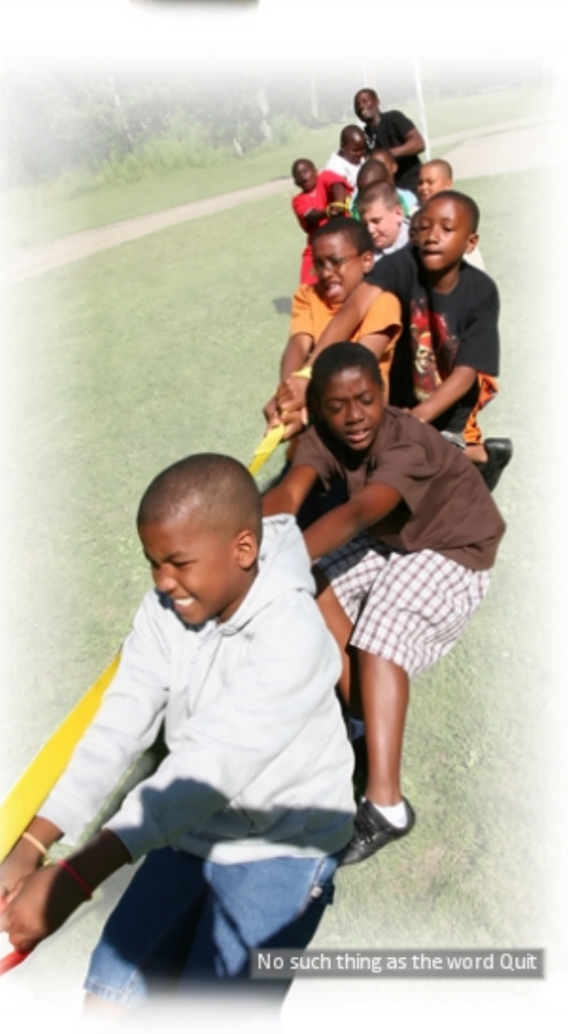
No such thing as the word Quit