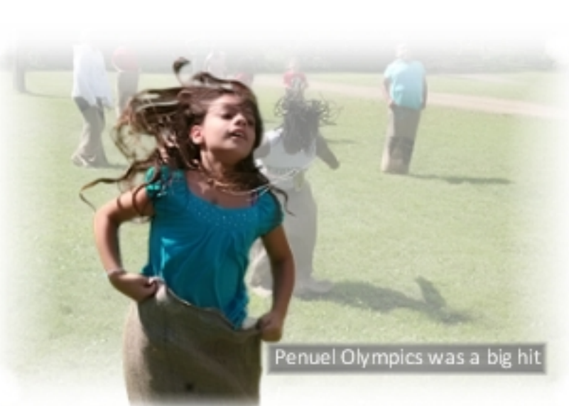
Penuel Olympics was a big hit

We would really like a Ping Pong table with paddles and ping pong balls for our rainy day games Indoor rainy day activities (board games, beanbag toss, golf putting mat, coloring books and art supplies) Over head projector to display media to the kids if there is anyway that we could get a safe 4x4 family vehicle that will seat at least 5 donated to the camp it would be great. There were many times that my family and I were stuck here last winter with no way to leave.